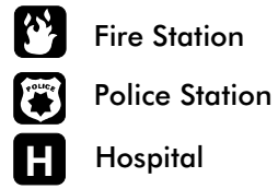
Figure 5.13-1 Locations of Public Facilities